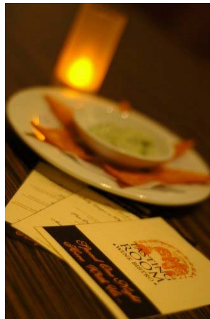
Nachos with an interesting cucumber mix dip

A full house on week night says a lot about the establishment. Clearly Tasting Room is not a well-kept secret despite it being tucked discretely one floor above Wine Cellar. All this means that booking is advisable before making your way there.