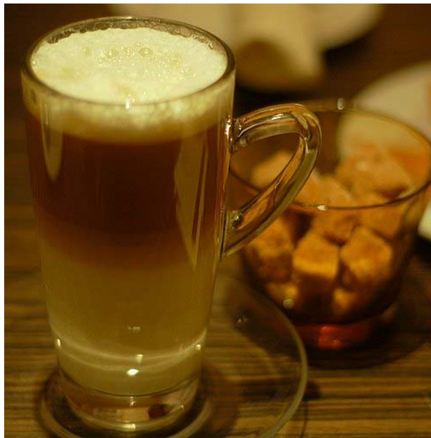
Latte with brown sugar cubes