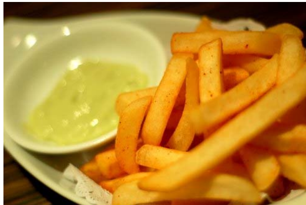
Fries with Wasabi Dip