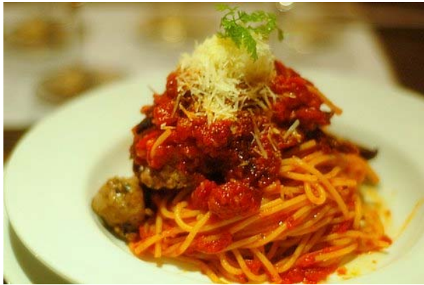
Sun Dried Tomatoes with Lamb