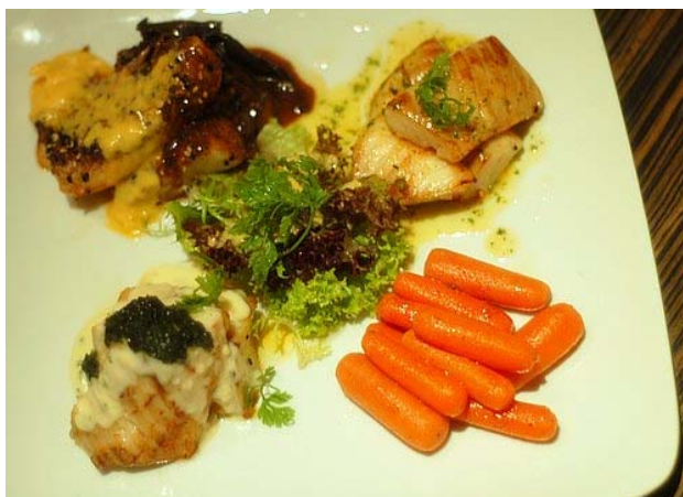
Pacific Cod Fish Flight

Not to be outdone, the Pacific Cod Fish Flight further tantalised our palate with its pan fried, oven-baked and seared offerings. The pieces of fish were so succulent and fresh and the sauces brought out the best in them. The dish worked very well with the well-balanced and buttery Les Janelles Chardonnay , Gunderloch Riesling Kabinett and of course, the Spanish Cava .