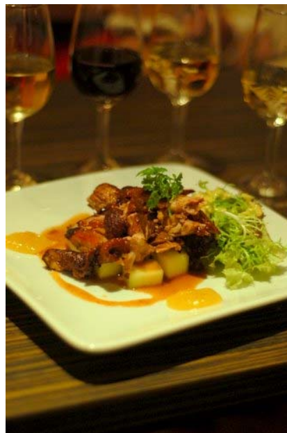
Roast Duck with Rock Melon

First we had the Roast Duck with Rock Melon . It looked mainly oriental, tasted oriental but the salad on the side gave it a continental flair. The duck was quite moist and the sweet sauce marinated into skin well. The Gunderloch Riesling Kabinet which has a rich texture and subtle hints of pineapple, nectarine and apricot went very well with the duck. So did my Spanish Cava.