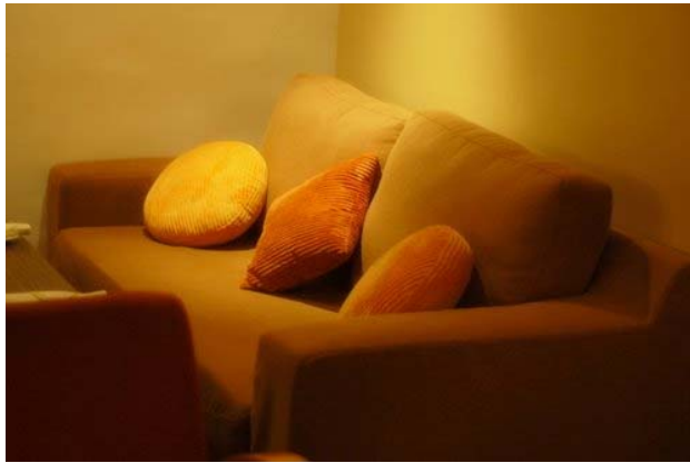
Comfort dining is the key word here