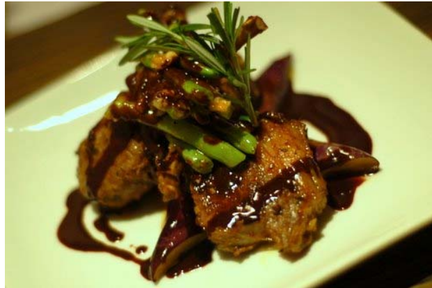
Lamb and Aubergine in Chocolate Sauce

beans were nicely done not overcooked. However, combined with the chocolate sauce it just tasted... strange. An acquired taste perhaps. Seeing that it was almost dessert –like, covered in chocolate and all, I tried it with the Spanish Cava . Not a bad combination.