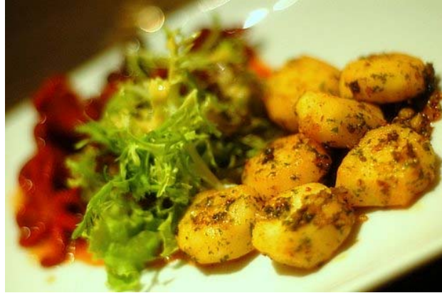
The divine water chestnuts

The squid was alright – you can tell that I'm not a squid person. Unfortunately, Chief Eater (my fellow reviewer) bit into a grain of sand embedded in the baby octopus which threw a small spanner in the works. Ouch.