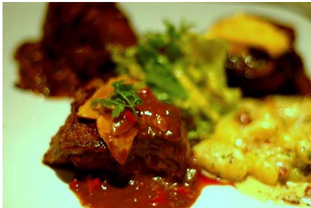
Australian Premium Angus Beef Flight

The juicy and tender Australian Premium Angus Beef Flight came pan-fried, oven-baked and seared. One had the luscious foie gras on the top – after tasting that combination, I cannot imagine a better topping for the amazing steak. All of them were prepared medium-rare, which is the best way to eat beef. Anything more and the steak will become tough and rubbery. The lavishness of this beef flight made a nice match for the full-flavoured, smooth, crisp and velvety Hermanos Lurton Tempranillo .